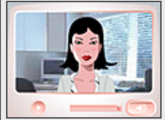
Examples of new Player Skin designs

Login to your account to start using these exciting new skins.