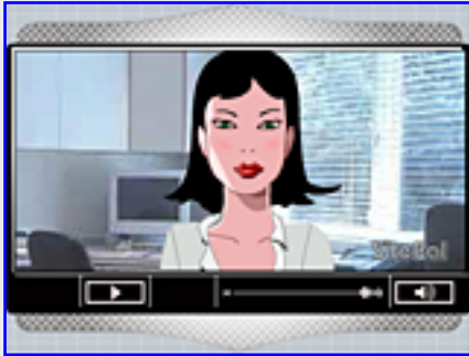
New player skin example: "Glux"